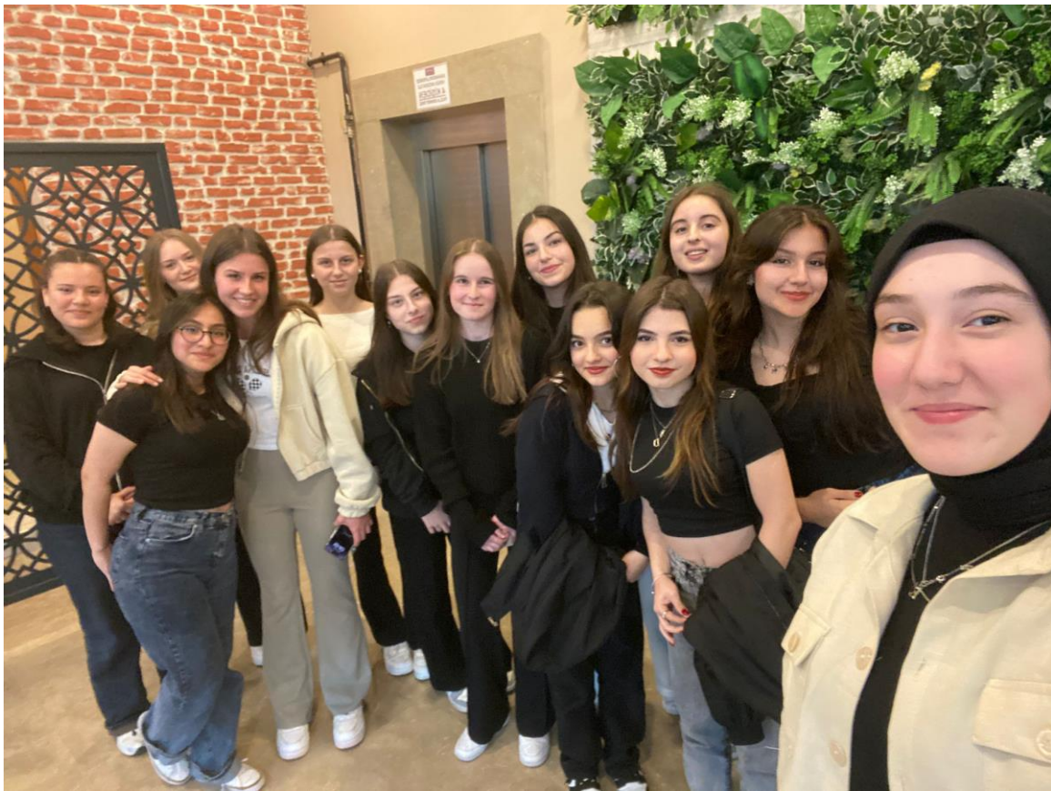
This is our first group photo together, taken during our first meal. It marks the beginning of new friendships and the start of our shared journey.