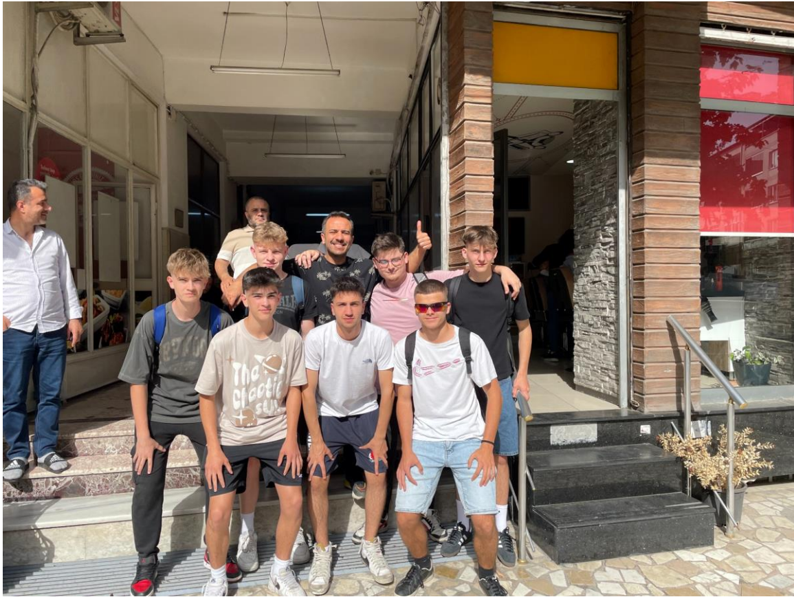
After our visit to the local barber, we took a group photo with everyone who got haircuts and the barber himself. It was a unique and funny experience that we all cherished.