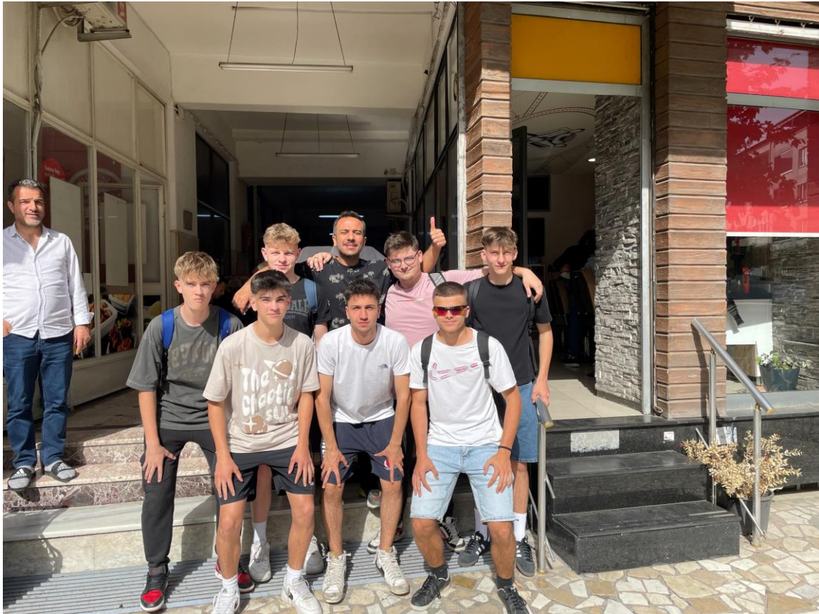
The barber visit was a really fun experience, and the barber was very friendly. This photo reminds me of the laughter and camaraderie we shared.