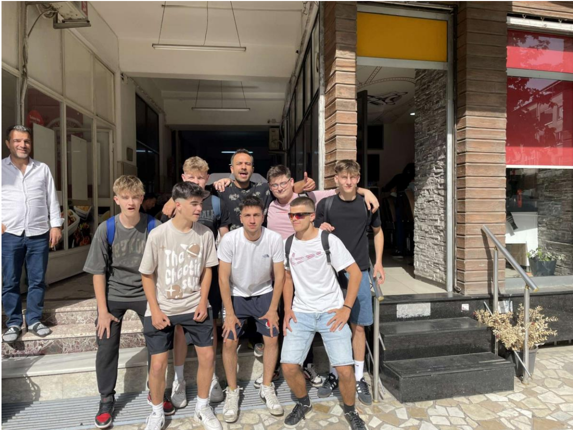
This photo was taken after our visit to a local barber. It includes all the students who got haircuts and the barber himself. It was a unique and funny experience that we all cherished.